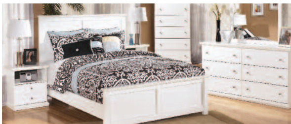
5 PIECE BEDROOM $499.99 Includes Queen Bed, Dresser & Mirror