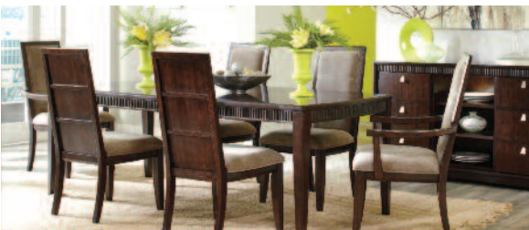
5 PIECE DINING ROOM $699.99 Includes Table & 4 Side Chairs