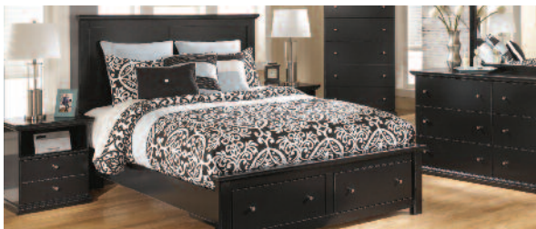
5 PIECE BEDROOM $499.99 Includes Queen Bed, Dresser & Mirror