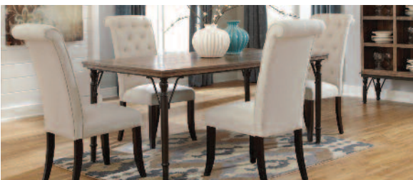
5 PIECE DINING ROOM $699.99 Includes Table & 4 Side Chairs