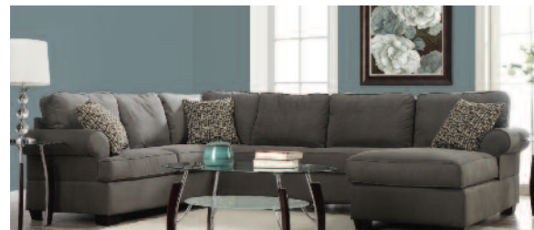
3 PIECE MODULAR $699.99