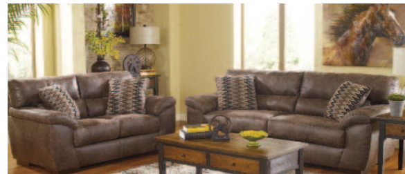
SOFA & LOVESEAT $699.99