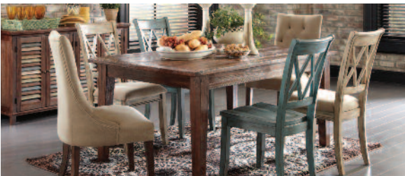
5 PIECE DINING ROOM $699.99 Includes Table & 4 Side Chairs