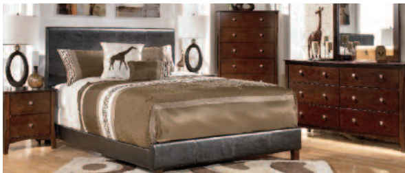
5 PIECE BEDROOM $499.99 Includes Queen Bed, Dresser & Mirror