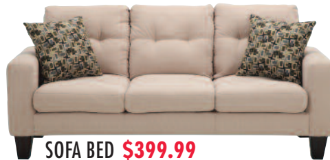
SOFA BED $399.99