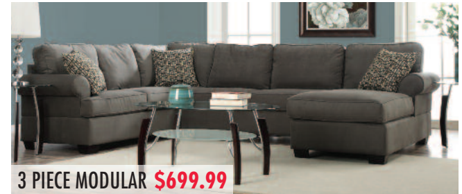
3 PIECE MODULAR $699.99