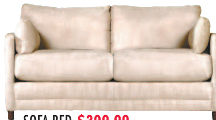
SOFA BED $399.99