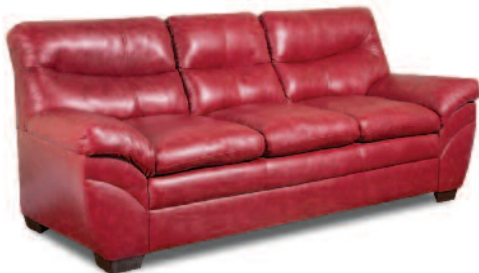
BONDED LEATHER SOFA $299.99