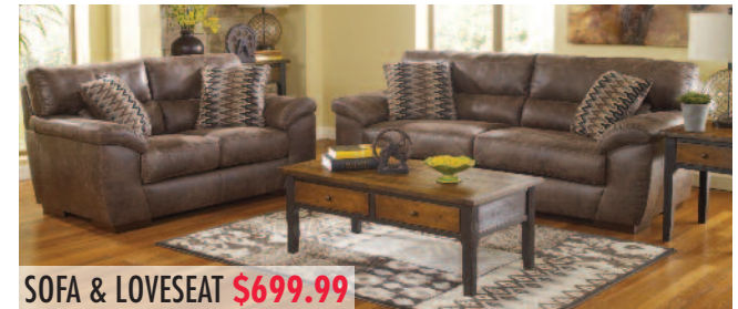
SOFA & LOVESEAT $699.99