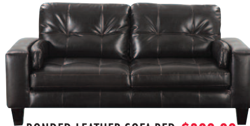
BONDED LEATHER SOFA BED $399.99